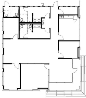
2,674 SF Spec Office