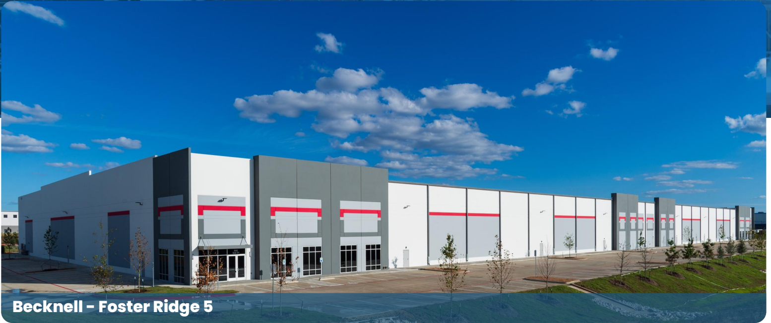
Becknell - Foster Ridge 5